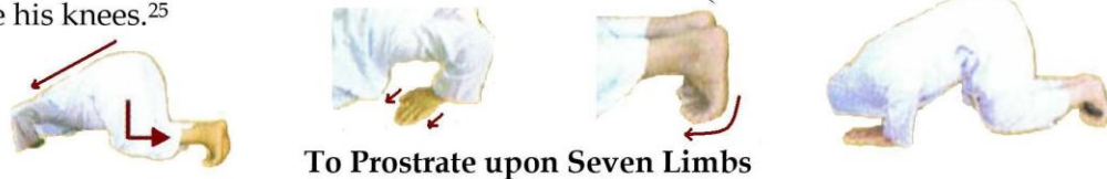
To Prostrate upon Seven Limbs

Then he is to go down in prostration, placing his hands down before his knees, due to that which is established from him ﷺ that he would place his hands upon the ground before his knees. 25